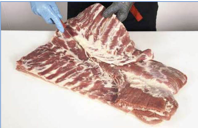
4 Remove ribs and cartilage by sheet boning.