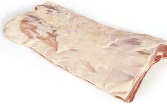
2 Remove rind and excess fat from the belly. Maximum fat thickness not to exceed 10 mm