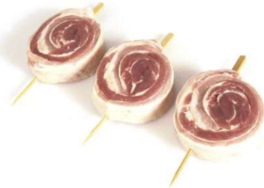
6 Roll and skewer belly and cut into portions.