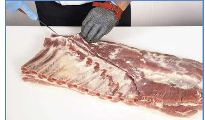
3 Remove breast bone (Sternum) and expose rib cartilage.