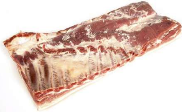
1 Bone-in Belly.