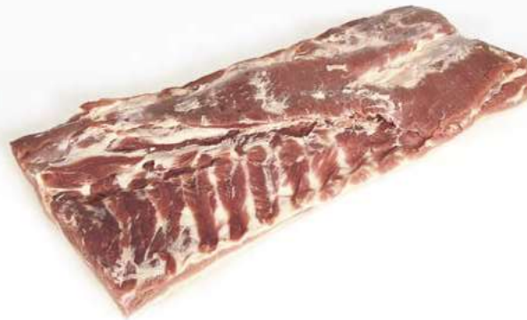
5 Boneless, rindless and trimmed belly.